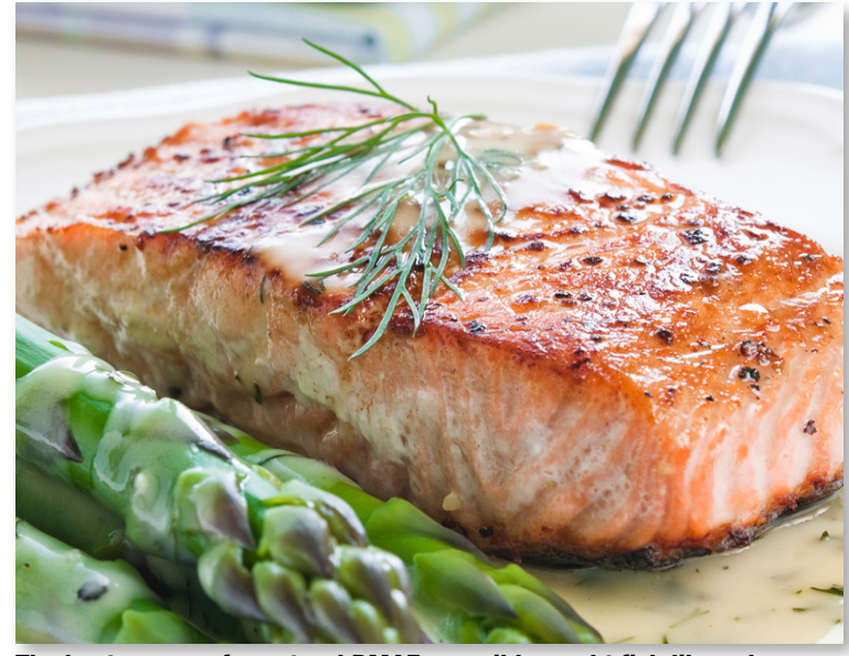
The best sources for natural DMAE are wild-caught fish like salmon and small, oily fish.

How much should you take? Clinical studies of DMAE have used doses of up to 1600 mg per day with no reports of side effects and no known drug interactions.<sup>10</sup>