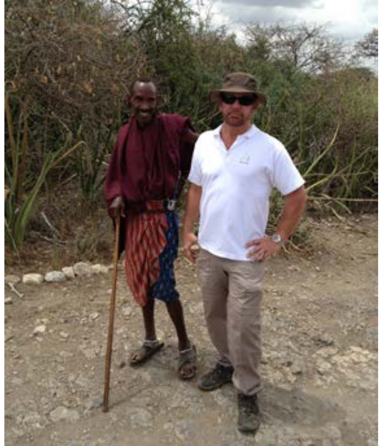
The Maasai are fiercely independent, so they still look like hunter-gatherers. Here I am with my Maasai warrior guide in Eastern Africa. He wears red to show bravery and carries his hand-carved Rungu (Swahili for “walking stick”) wherever he goes.

So I wanted to preserve as much of the Maasai's local herbal healing knowledge and plant lore as I could. And find out what it is that keeps them so lean and healthy.