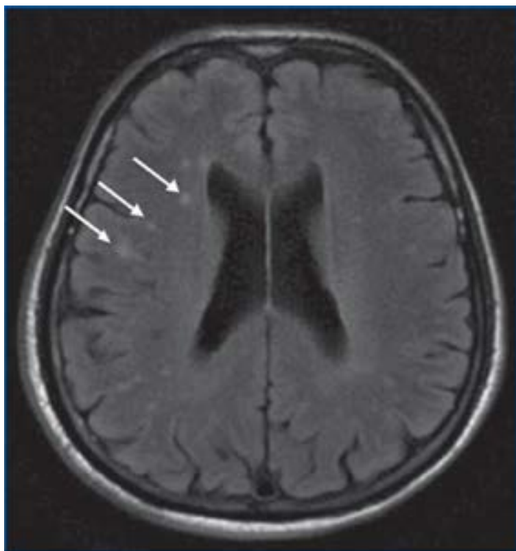
The arrows show where WMLs have formed in the brain.